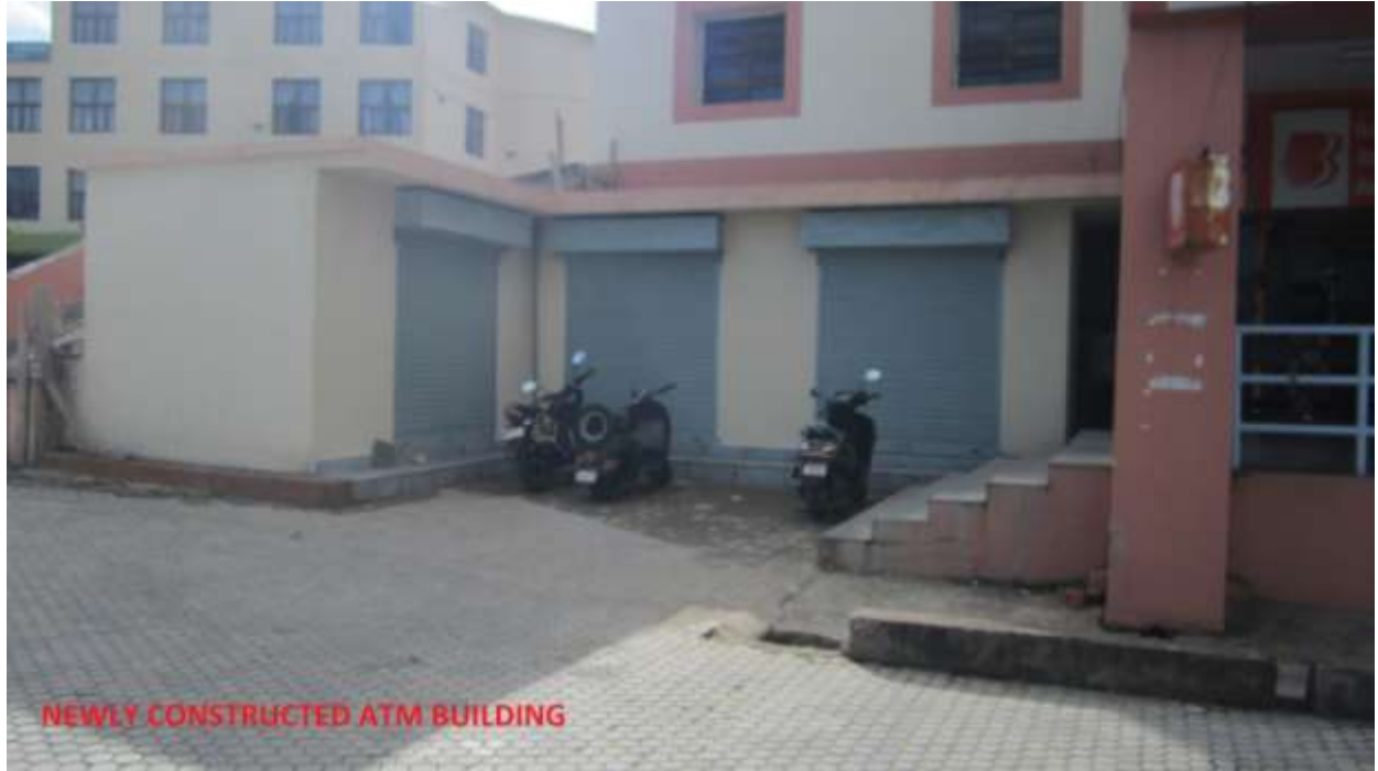
NEWLY CONSTRUCTED ATM BUILDING