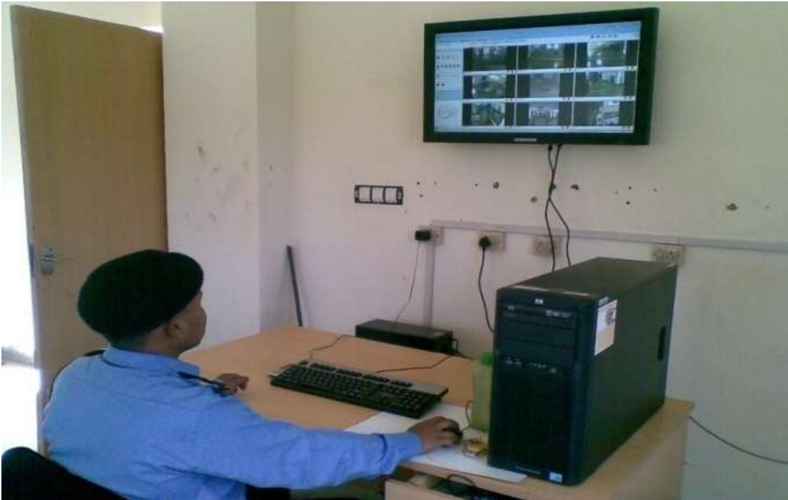
Control Room for CCTV